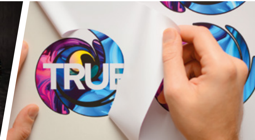
DIE-CUT LABELS AND DECALS