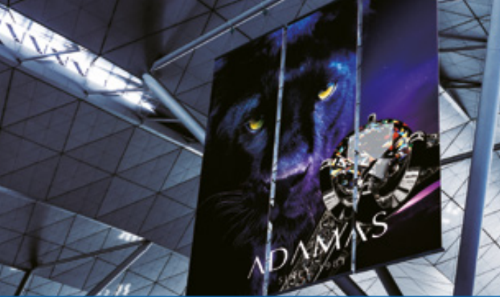
POSTERS, SIGNS AND BANNERS