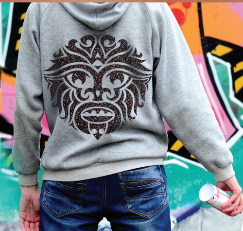
HEAT TRANSFER APPAREL