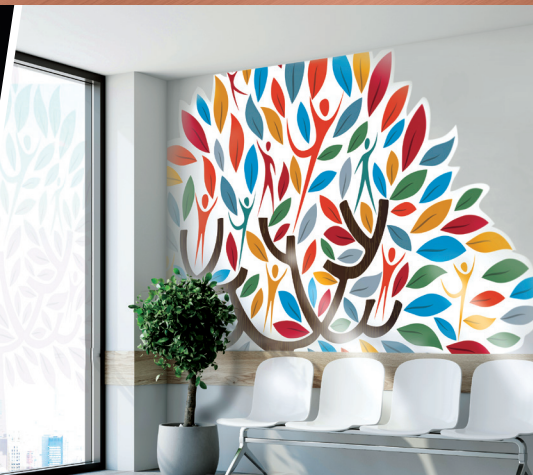
WINDOW AND WALL GRAPHICS