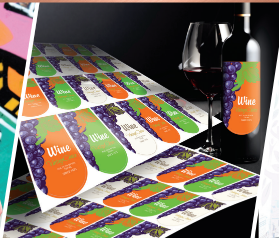
CONTOUR CUT LABELS