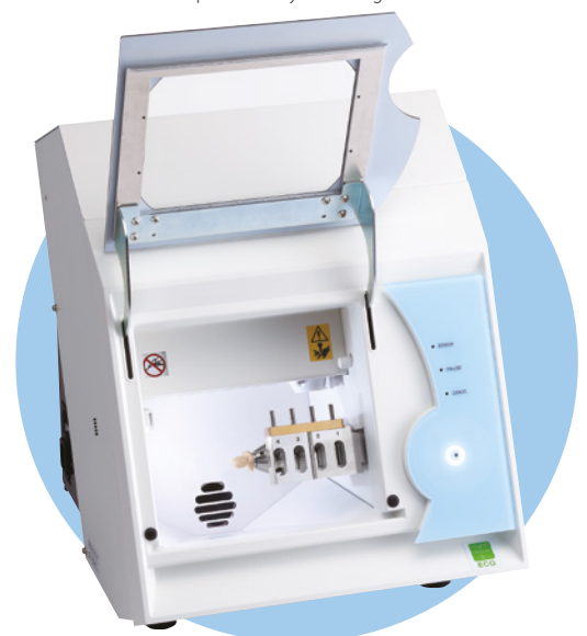
DWX-4 shown with optional 4 bay tool charger.

Roland dental milling machines combine superior performance with legendary reliability. Tens of thousands of Roland users in more than 133 countries rely on Roland's unmatched customer service and support. As a company, Roland DG's ISO 9001:2008 and 14001 certifications assure consistent quality in manufacturing.